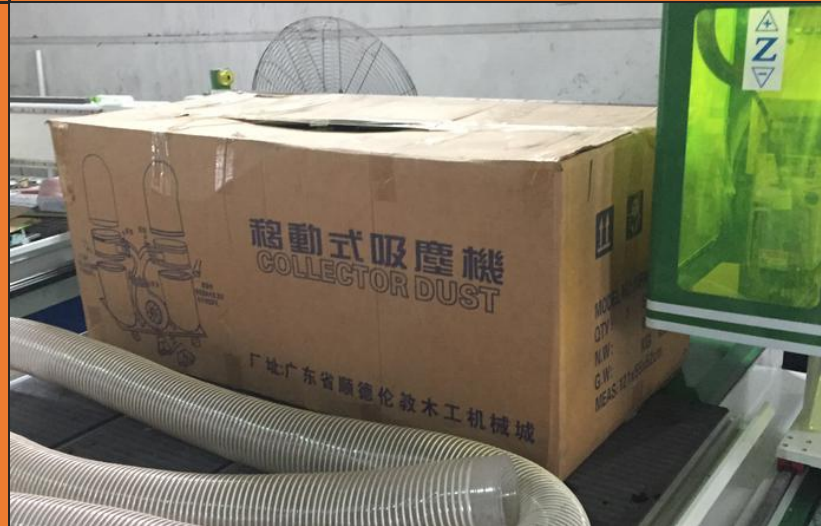
3.0kw dust collector two bags